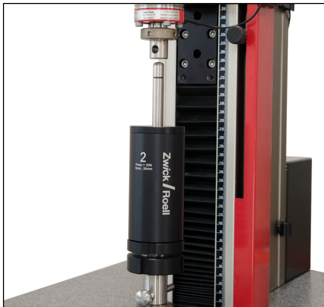
Device for checking load cells